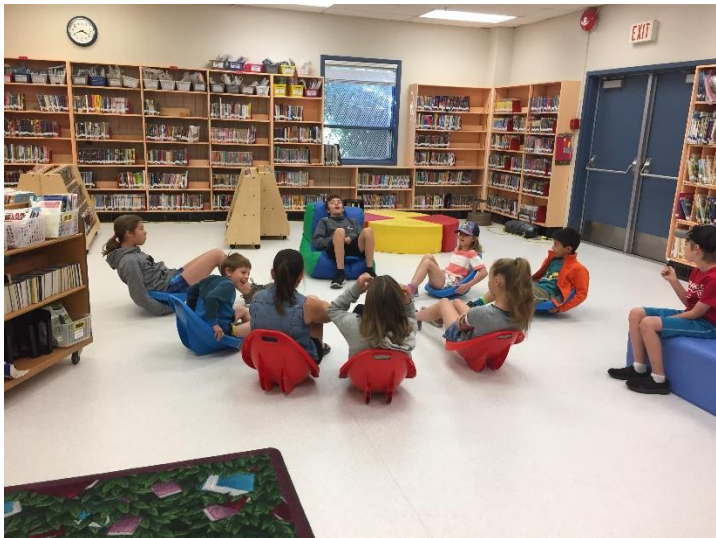
Some of our Bus students enjoying the new chairs in the library purchased by PAC.